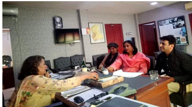
Advocacy & Consultation meeting with Honorable Nuzhat Shirin, Chairperson SCSW Govt. of Sindh.