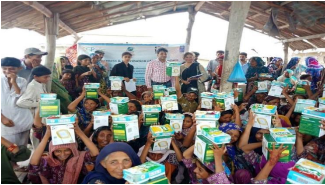
Awareness & Distribution of Solar Lantern in Chashma Goth, District Malir, Karachi, Sindh.

Project Title: Establishing Renewable Energy Relief Station and Combating Sexual and Gender-Based Violence (SGBV).