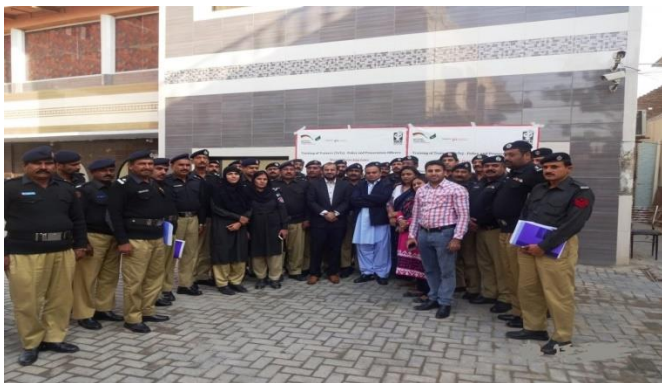
A Group photo ToTs held in Sukkur, Sindh

Project Title: Capacity Building of Sindh Police on Juvenile and Women Laws