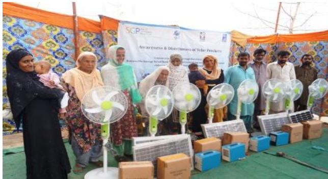
Awareness & Distribution of Solar Fan Kits