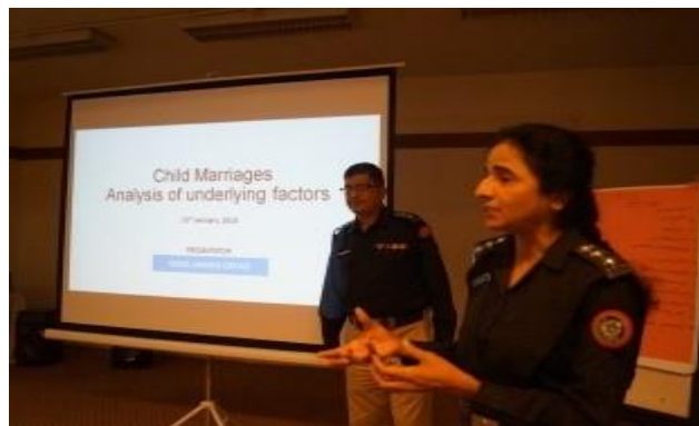
Group Activity on Child Marriages