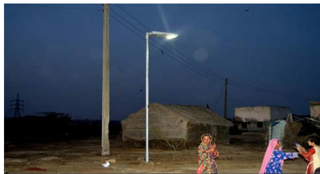
Installed Solar Panel Street Lights to prevent harassment, kidnapping & other incidents