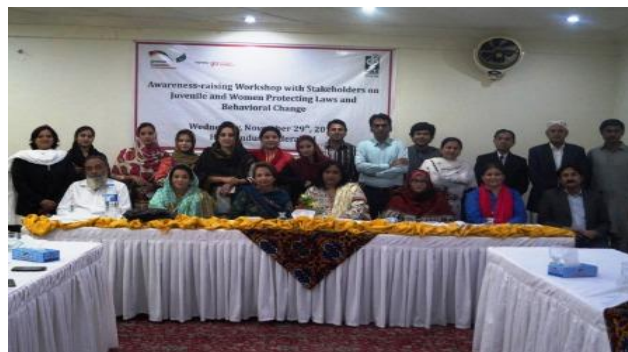
Awareness-raising workshops on 'Laws Protecting Women, Juveniles & Behavior Change' in Karachi & Hyderabad, Sindh