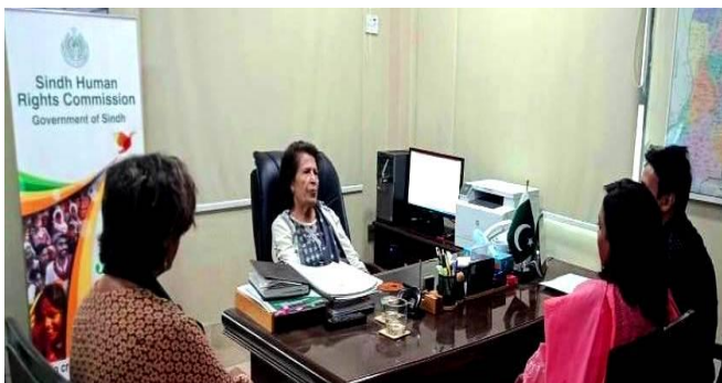
Advocacy & Consultation meeting with Honorable Justice (Rtd.) Majida Rizvi – SHRC Govt. of Sindh