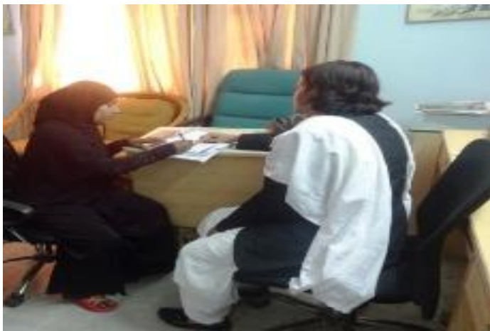
WAR advocate during legal counseling session & signing of Vakalatnama

Project Title: ‘Survivors Support for Accessing to Justice’