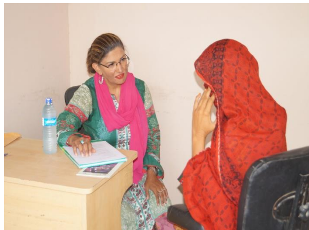
Psycho-social counseling session to empower survivor