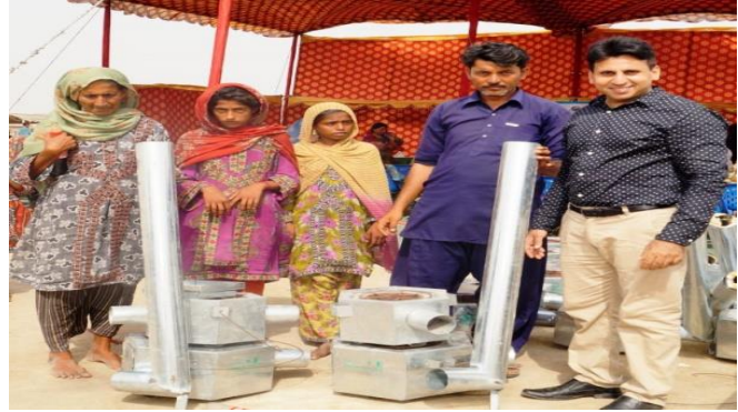
Awareness & Distribution of Portable Metallic Stoves in Chashma Goth, District Malir, Karachi, Sindh